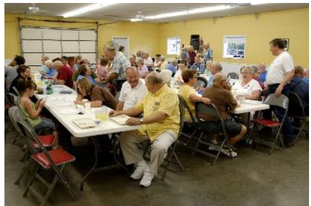
Saturday's Potluck Dinner